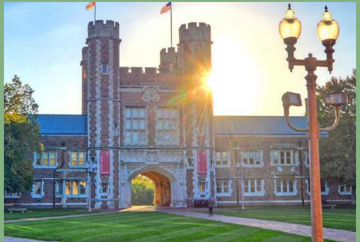
WASHINGTON UNIVERSITY IN ST. LOUIS VISITED CAMPS ON APRIL 29TH, 2019 DURING LUNCH.

It has been a great start in understanding the process of universities this year. It has been a big year in promoting SJA Jeju to universities. I hope that it can be a great opportunity for our first upcoming graduates in 2020.