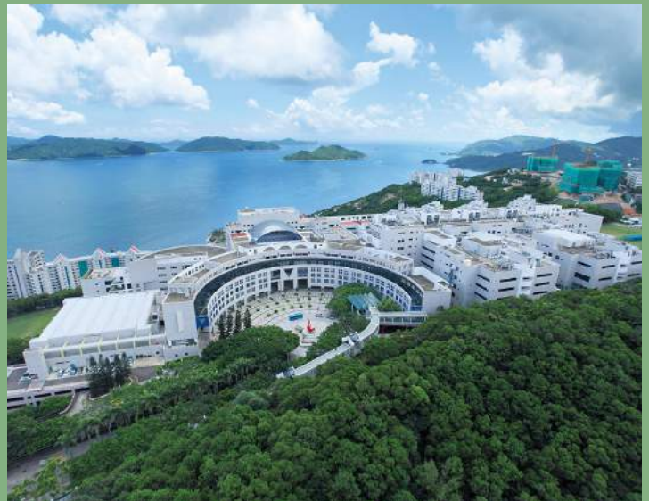
HONG KONG UNIVERSITY WILL VISIT ON MAY 27TH, 2019 DURING LUNCH.