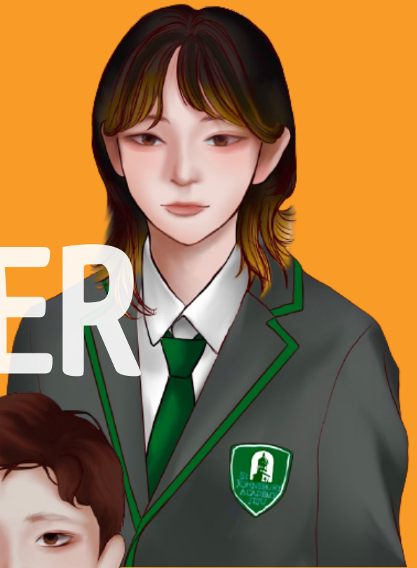
Illustration by Rin Lee